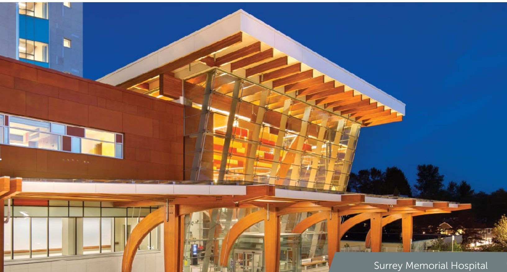
Surrey Memorial Hospital

In addition to rotations offered at RCH, rotations are offered in the community in New Westminster, Burnaby and Surrey, and at Surrey Memorial Hospital (SMH). All sites are accessible via automobile or transit. Fraser Health offers a Transit Incentive Program that provides employees with discounted rates on TransLink monthly passes or stored value loaded onto their Compass Cards. A staff shuttle is available for those who either prefer or require transport. SMH also has bicycle parking facilities for those who prefer to ride.