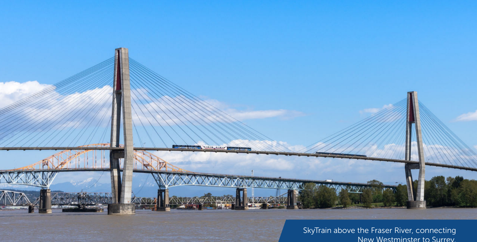
SkyTrain above the Fraser River, connecting New Westminster to Surrey.

RCH is a major regional critical care site providing a range of services, including trauma medicine, orthopedic surgery, cardiac surgery, neurosurgery, plastic surgery, interventional cardiology and thoracic surgery. The hospital also houses outpatient and inpatient mental health services, located in the Mental Health and Substance Use (MHSU) Wellness Centre.